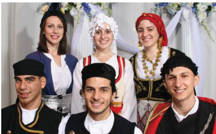
T'Asteria Dancers of St. George Greek Orthodox Church