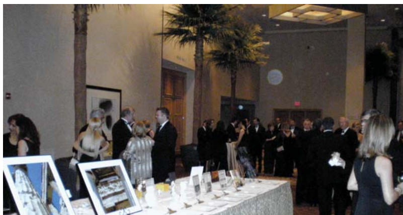
View of the Silent Auction